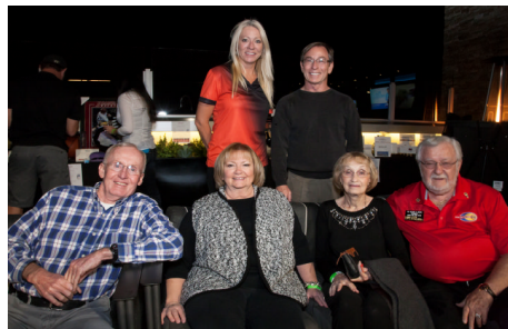
AOSF Board Members at Top Golf

A: You never know what will pop up! One thing I know is that I would like to volunteer my time on the unit in 2016! Thank you for taking the time for this interview and trusting me to be on the AOSF Board. I have enjoyed working with all of you on this event look forward to making 2016 a memorable experience as well!